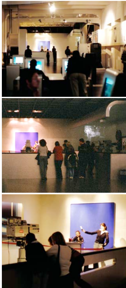
Figure 2. Visitors in the exhibition – a three step approach to the NewsRoom: a) long distance view, attracting attention, b) focused attention c) close-by observation and lining up

The photos in figure 2 show how the set-up calls for attention. This not only refers to the physical set-up but also for the use of color and light. The large room is relatively dimly lit and densely populated with benches and seated exhibits. Standing, one sees through the entire room to the Newsroom, which is well lit, with a bright blue background. This point of prospect drew people to the installation and to observe other visitors using it (the honeypot effect), often coming back several times. A further noticeable feature is the long aisle leading up the podium. Similar to a stage, it separates observers from interactors and turns both interacting and observing into a defined, distinguishable activity. The long aisle appears as a threshold for some visitors, but also attracted curiosity. Figure 2 shows three stages of approaching the installation that appear to provide a form of progressive lures. From the center of the digital room, observation is a peripheral activity, in which visitors may become interested and move closer. The balustrade provides the location for focal awareness activities, where people observe and socialize. Here there is a shared focus for a large number of people, which provides content for chat (honeypot effect). Standing at the podium is the last stage of direct interaction. Moving from one activity to the next means