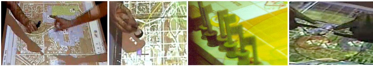
Figure 2. The EDC: (left to right) handing over a pen at the SmartBoard, using tangible tokens on the PITA-BOARD to create a new bus stop, multiple interaction objects on the re-designed PITA-BOARD, and highlighting overlaps of desired walking distance

representations that take up ‘interface estate’ has to be justified by their relevance – either in their tangibility being a salient part of the representation (e.g. emphasizing 3D-ness or material qualities) or in effecting the style of interaction. Thus these interactions should not be peripheral, but need to be salient to the overall use process. If we aim for tangible interaction, tangibility as well as the hybridism of the system should be noticeable and not be overshadowed or invisible. Legibility of system reactions and experience of the system as being hybrid are enhanced by a perceived coupling between physical objects and digital representations and between user actions and effects - a kind of faked causality. Here the main concepts are: