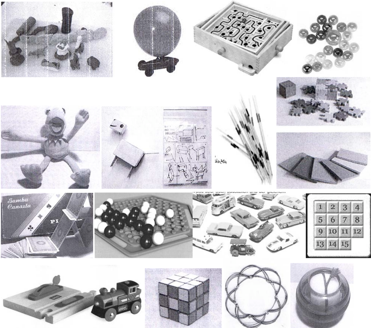
Fig. 2: a range of the toys explored (pictures taken from reports). Top row: plasticine, car driven by a balloon, wooden maze, glass marbles. Second Row: Kermit puppet, 'Happy horse' set, 'Happycube', Mikado sticks. Third row: set of cards, Abalone game, matchbox cars, sliding puzzle. Last row: toy train, Rubics cube, planetary rings, Gyrotwister.

“The possibilities for being expressive or to play with colour pencils are almost unlimited. (...) You can do pictures or handwritten poems, just about everything. (...) Even though the tool is controlled directly, the created product triggers creative processes in the user. This spawns an interplay between creating and creation.”