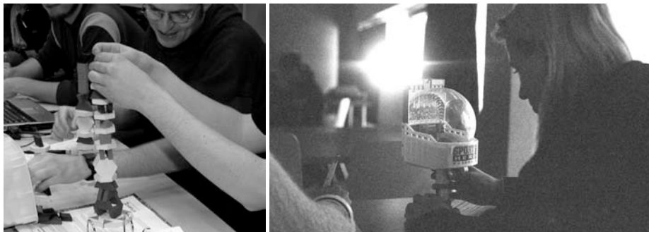
Fig. 3: in-class exercise, working with a construction toy and a handheld baseball stadium that counts how often the ball is shot into the goal

An interesting observation in comparing students findings in the different settings of the exercise (homework, in-class) was that while students in the in-classroom setting predominantly described balls (regardless of material) as rather limited in play value, behaviour and action space (“you can bounce it, throw it – that’s about it”), many teams that chose a ball as one of their objects for the homework exercise came to the conclusion that it was in fact the most versatile toy.